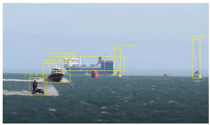
Tracking and classifying boats at sea

The Vision4ce CHARM-100NX is a standalone video processing board for embedded video and image processing applications, which is designed to host the GRIP View software. The software includes the field proven DART video tracking software. The CHARM-100NX is based on a NVIDIA Xavier embedded processor which incorporates a multicore ARM processor and powerful GPU. Video interfaces are provided for 6G, 3G, HD and SD video in digital formats.