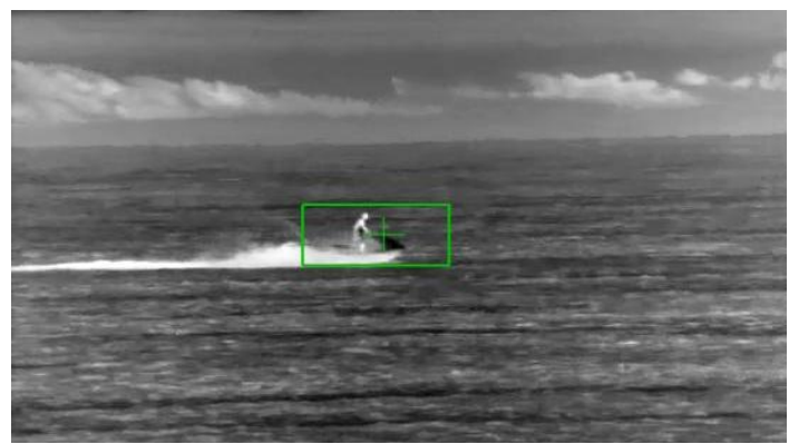
Tracking a jet-ski using IR video

The Vision4ce CHARM-100 is a standalone video processing board for embedded video and image processing applications which is designed to host the Vision4ce VMS software. The VMS software includes the field proven DART video tracking software. The CHARM-100 is based on a NVIDIA Jetson embedded processor which incorporates a multi-core ARM processor and powerful GPU. Video interfaces are provided for HD and SD video in both analog and digital formats.