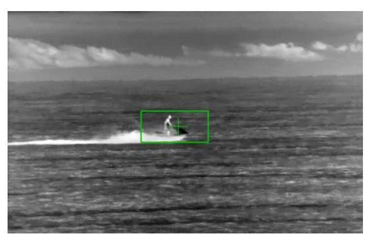
Tracking a jet-ski using IR video

The Vision4ce CHARM-80 video tracker uses the CHARM Module and the DART (Detection & Acquisition, with Robust Tracking) detection and target tracking software hosted on an embedded multicore ARM processor board for video tracking and image processing applications. The CHARM80 has SD resolution analog video interfaces