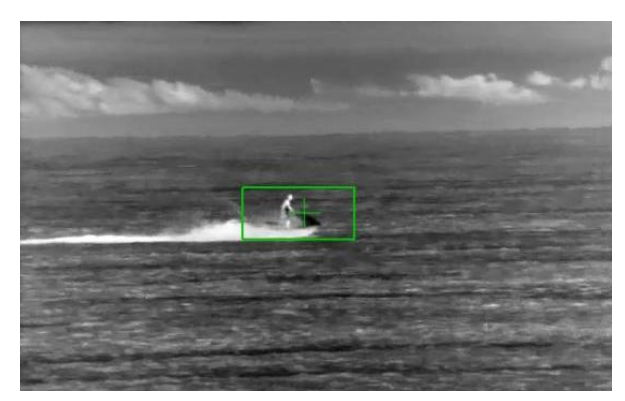
Tracking a jet-ski using IR video