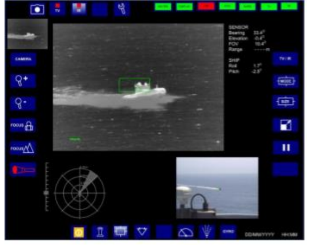
Example GRIP-VMS Graphical User Interface